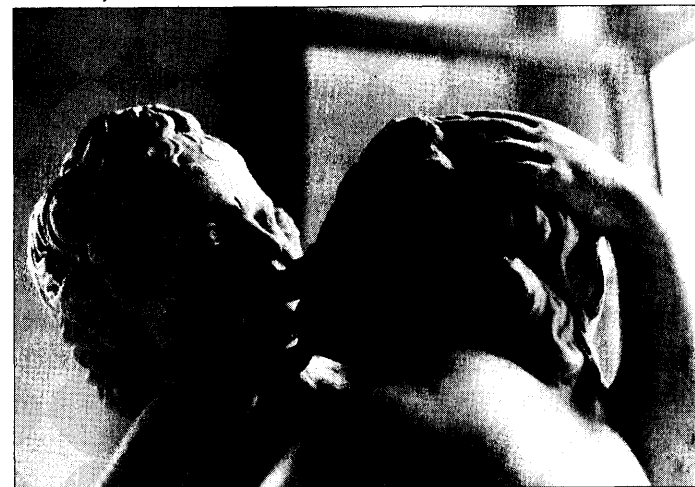
Eros and Psyche

cal and profound psychological implications, we might simply acknowledge the importance of our own beauty and allure, however great it is, however slight and relative. Renaissance philosophers said that beauty is one of the graces of human life, a gift and a power that should not be underestimated.